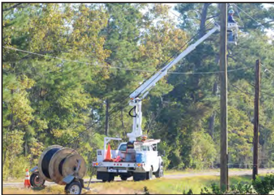
Excellent Side Reach For Pole Setbacks