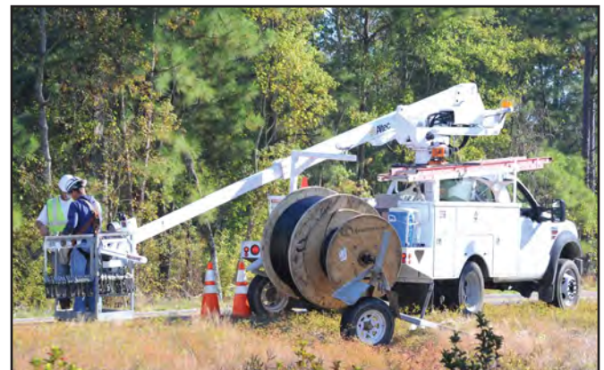
Platform Access From Ground