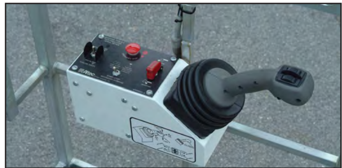
Optional Single Handle Proportional Controller

Altec Aerial Devices meet or exceed all applicable ANSI Standards as of the date of manufacture. Altec reserves the right to improve models and change specifications without notice or obligation.