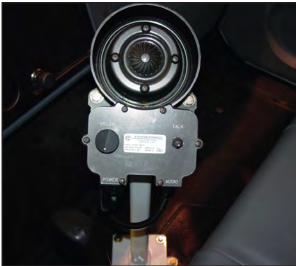
Cab Mounted Communication System

*Based on a 40 in (1016 mm) Chassis Frame Height