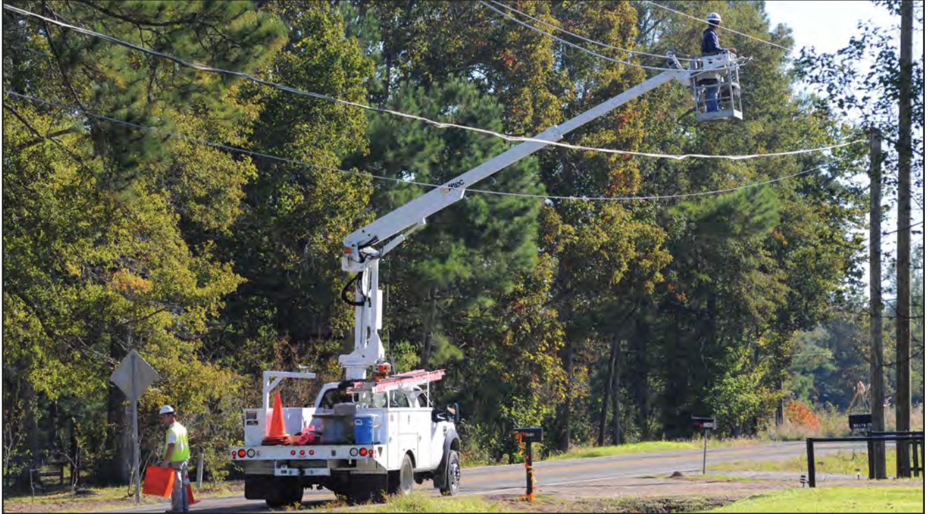
Stable During Mobile Use