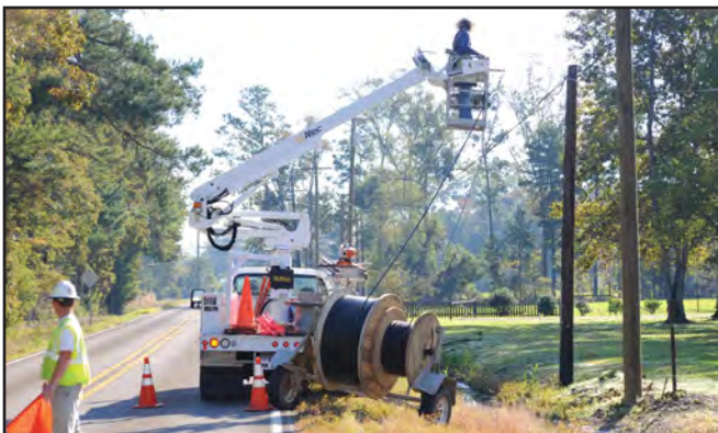
Pulling Eye Mount Can Be Attached To Either Side Of Platform